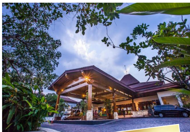
Venue at Lorin Solo Hotel